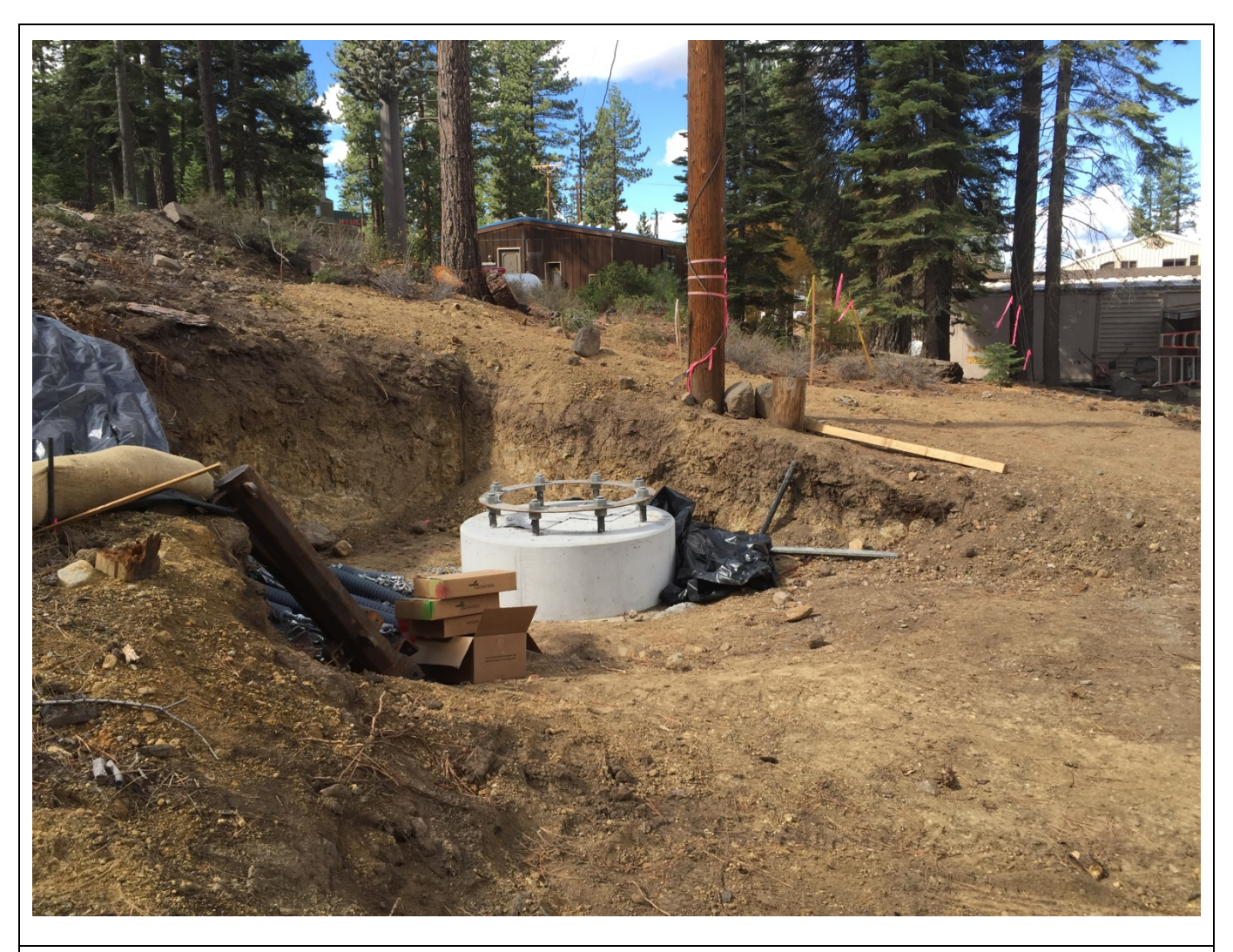
Photo 2 : Base for Pole #291261 poured and being prepared for pole installation.