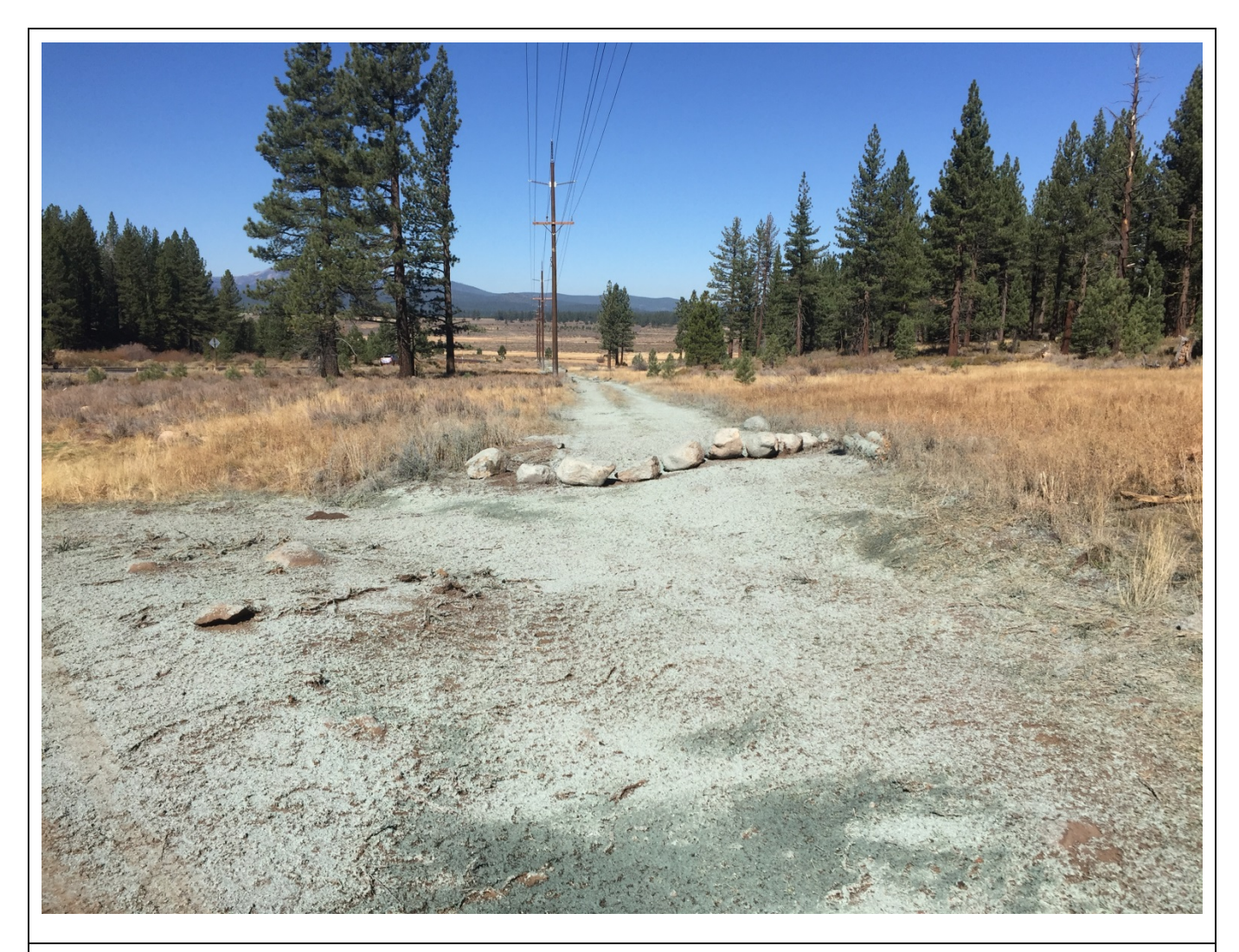
Photo 1 : Right-of-way cleared of equipment and materials, rock barriers installed to prevent unauthorized access, and disturbed areas hydro-seeded. Between Poles #291080 and #291081.