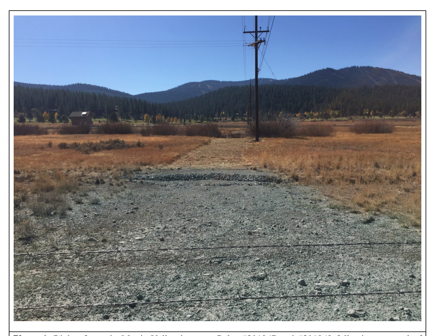
Photo 6: Right-of-way in Martis Valley between Poles #291067 and #291068 following removal of timber matting, timber bridges, equipment, and materials. Disturbed areas hydro-seeded and areas where timber matting had been used hand-seeded. The ROW has been fenced to prevent unauthorized access.