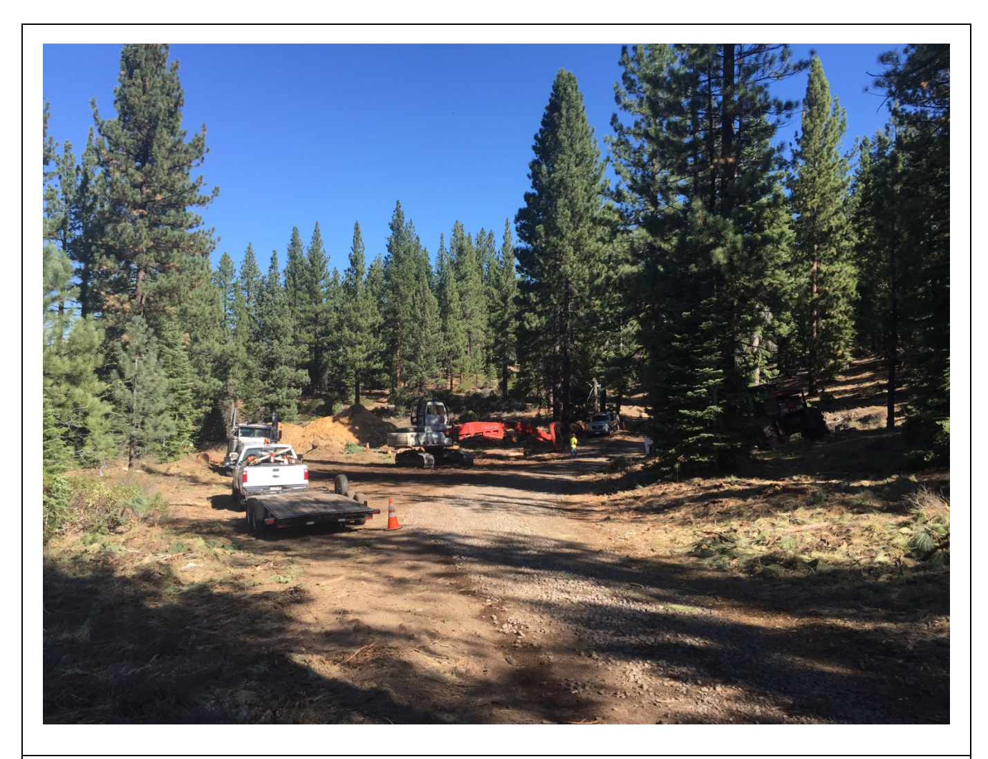
Photo 4: Demobilization at landing for timber operations near Pole #291112. Equipment being removed and erosion control measures being installed.